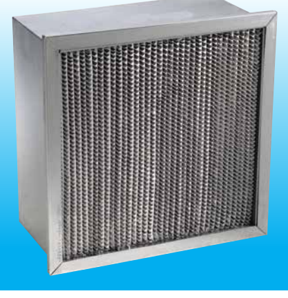
Style VMB - Single Header