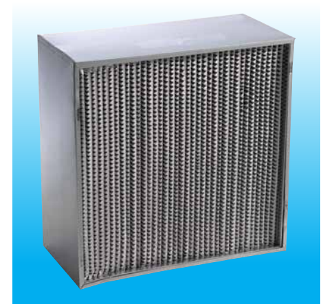
Style VMA - Box Construction (No header) Particle Board Construction