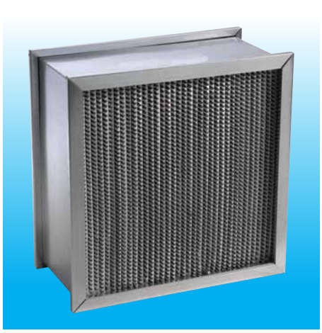
Style VMC - Double Header