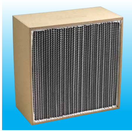
Style VFA - Box Construction (No header)