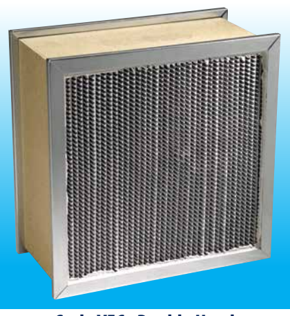
Style VFC - Double Header