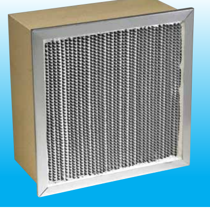
Style VFB - Single Header